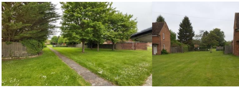
Entrance from Mendip Road and Pennine Drive