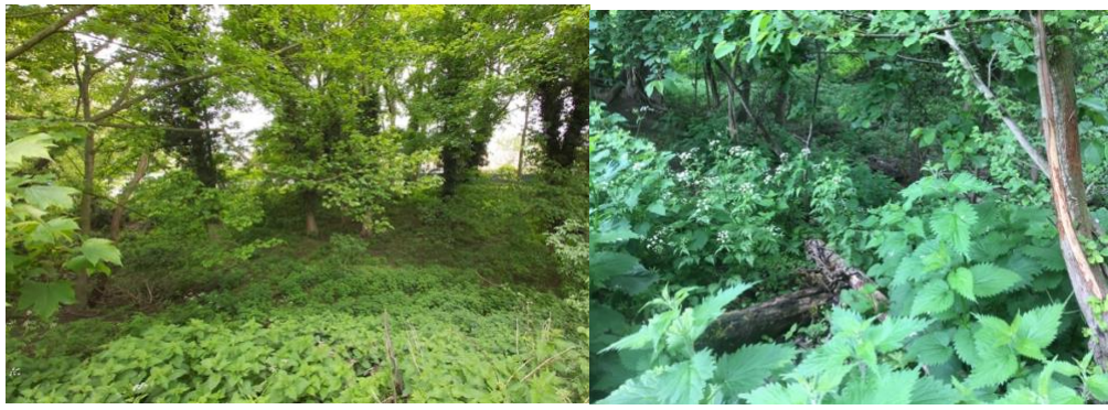
Spiny Shown on the 1884 map of Edith Weston.