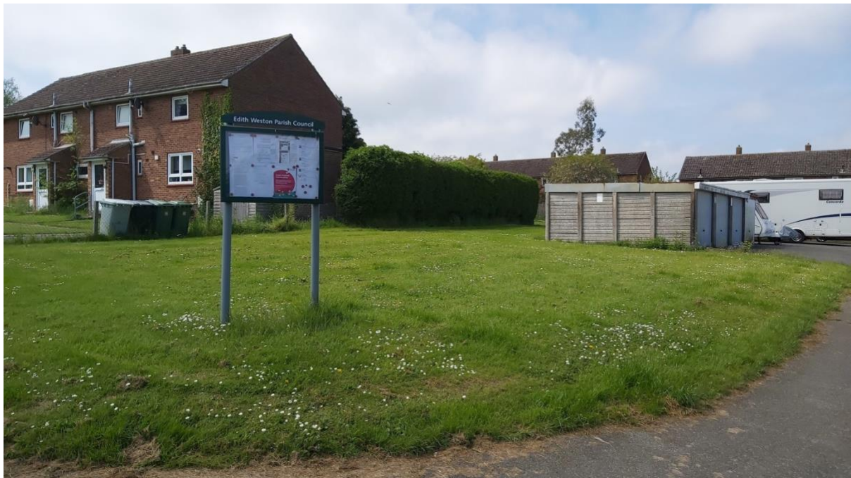
Photo from Garages end showing parish notice board.