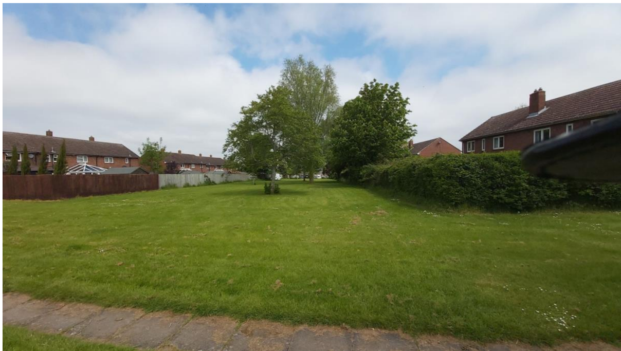
Photo from the Manton Road end looking back towards the parking and garages.