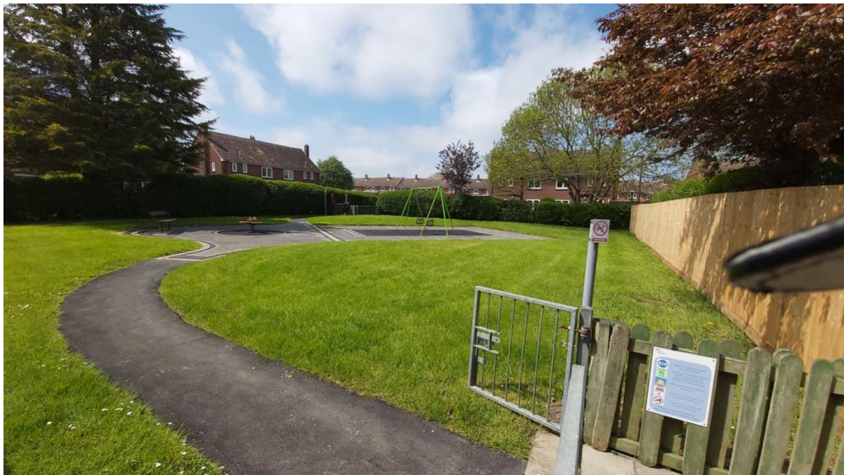
Entrance from Derwent Ave