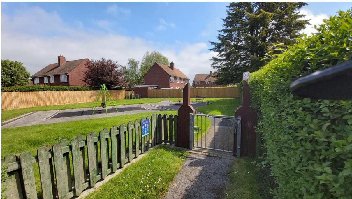
Entrance from Ullswater Road