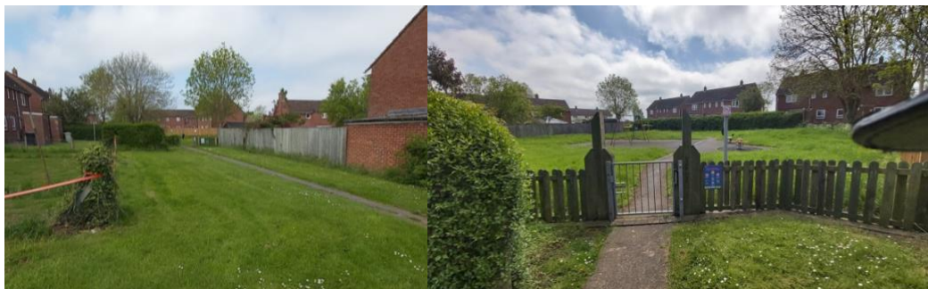
Entrances from Crummock Ave and Derwent Ave