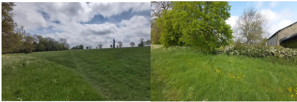
Photos showing public footpaths.