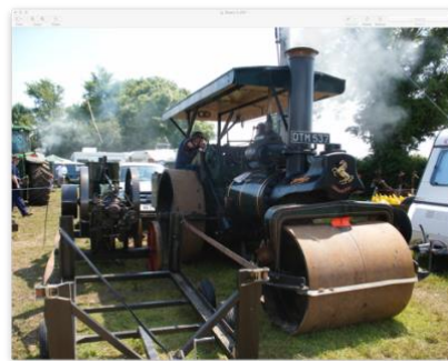
Photos from past Edith Weston Vintage steam fairs courtesy of a resident.