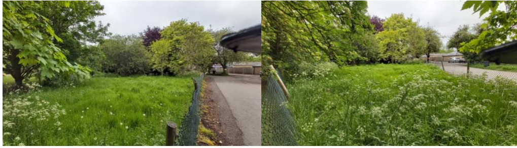
Photos of the meadow, showing proximity to shop/Post office car park.

wildflowers are an important wildlife habitat and forms a vital green lung next to the main road through the village. It is an area of great beauty full of wildlife and flowers. Part of the area forms adopted highway verge forming visibility splay for the junction of Church Lane and Normanton Road.